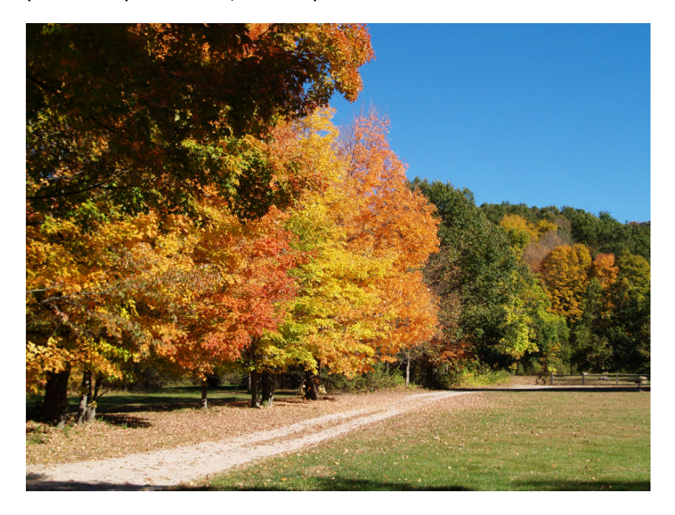
Hopefully the pathway you choose will be colorful and unobstructed.