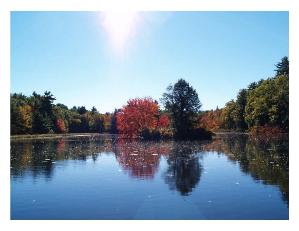
As the plan is implemented, it is important to take time out to be reflective.