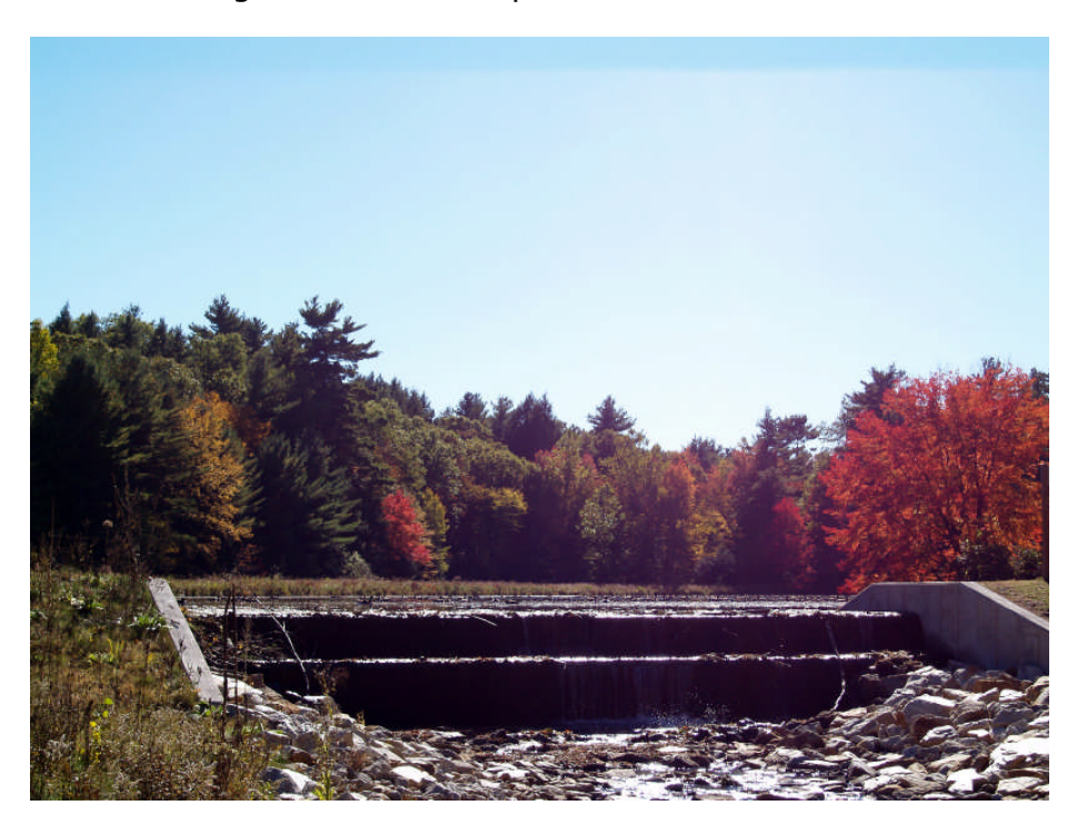
It is followed by very visible concrete steps that are part of an overall plan.