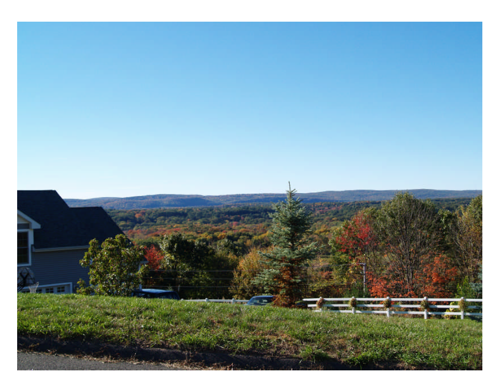
Effective organization development starts with a clear vision.